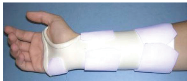
Example of orthosis for carpal tunnel syndrome

A hand therapist can help reduce the symptoms of CTS by first performing a complete evaluation to determine the main cause of the problem. He or she might recommend wearing a brace at night to keep the wrist in a safe position, or during the day for activities that might irritate the nerve. A hand therapist can provide patient education and recommendations for modifications to reduce symptoms during activities of daily living, work tasks and recreational activities. A hand therapist may also prescribe specific exercises to help in the recovery or prevention of future CTS occurrences.